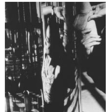
Wang Yao 2000